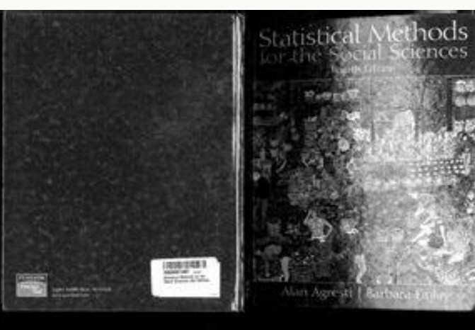
Statistical methods for the social sciences global edition. Statistical methods for the social sciences pdf. Statistical methods for the social sciences (4th edition) agresti and finlay. Statistical methods for the social sciences alan agresti. Statistical methods for the social sciences 4th edition. Statistical methods for the social sciences agresti. Statistical methods for the social sciences solution manual pdf. Statistical methods for the social sciences answer key.

Downloads link: http://lasturl.org/26386421